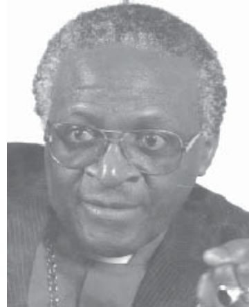
Archbishop Desmond Tutu First recipient of our Human Courage Award