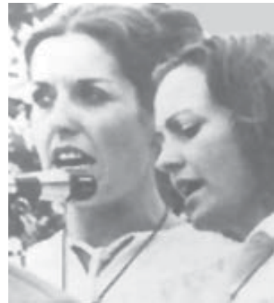
Betty Williams and Mairead Maguire Co-recipients of Nobel Peace Prize, Northern Ireland